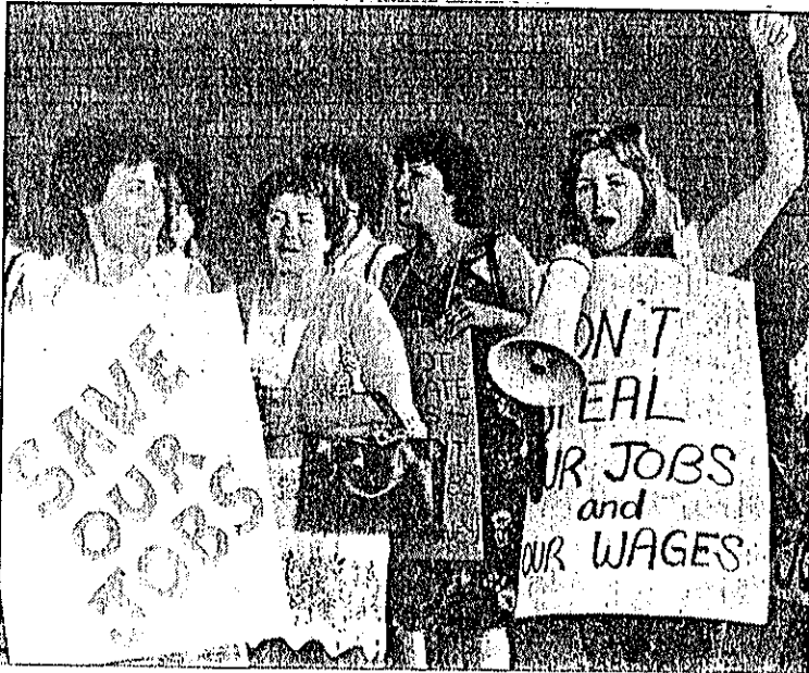
Workers at Woods demonstrate in 1984 to save the firm from closure

IN 1990, WE WENT THROUGH THE SAME THING AT OUR FOUNDING LOCAL, HARDING CARPETS. WE PULLED EVERY STRING WE COULD, SUCCESSFULLY, TO RESCUE THE FIRM FROM THE HANDS OF AMERICAN BUYERS AND THE BANKS. THERE IS NO DOUBT THAT THE WOODS AND HARDING PLANTS ARE STILL IN OPERATION TODAY BECAUSE THE WORKERS HAD THE COURAGE TO FIGHT FOR THEIR JOBS - SOMETHING MORE AND MORE WORKERS MUST BE PREPARED TO DO THESE DAYS.