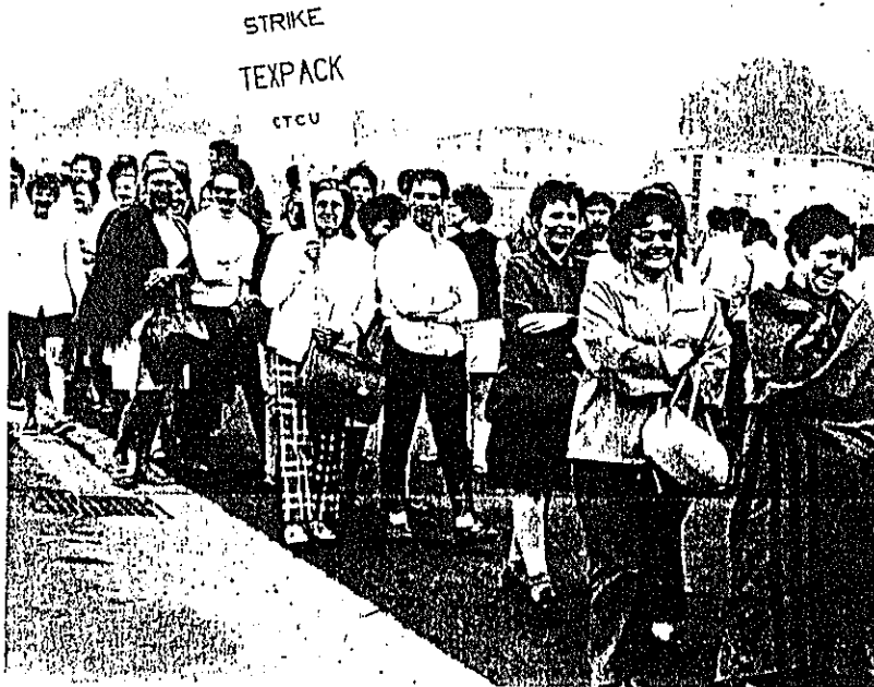
Texpack workers struggle against American Hospital Supply